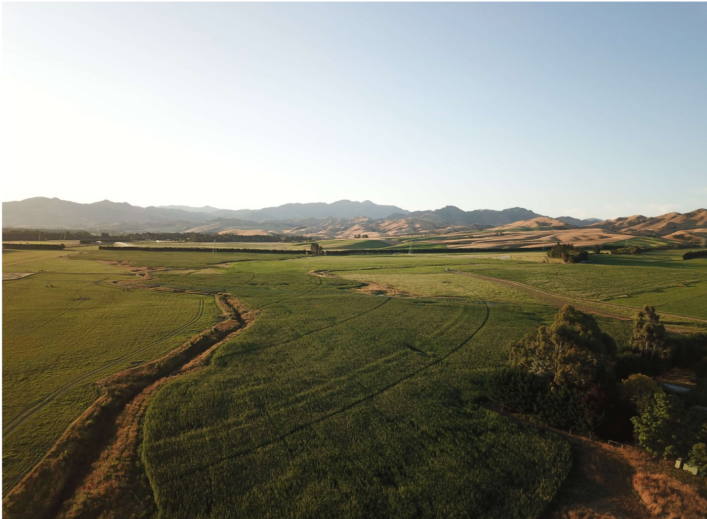
▼ MAINLAND HEMP, NORTH CANTERBURY